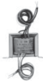
TR-705 70 Volt, 5 Watt

The TR-240, TR-740 and TR-780 are designed to be used with higher powered speakers withing a 70 volt system. Compensated windings in the TR-740 and TR-780 allow full rated power to reach the speaker. Caution should be taken to avoid overloading the amplifier when using compensated transformers.