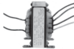
TR-740 70 Volt, 40 Watt