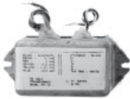
WP-10 70 Volt, 10 Watt, waterproof

All models are stocked in large quantities for prompt delivery. We ship same day on all orders placed by 2:30 CST, or we pay the freight.