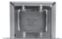
TR-240 70 Volt, 24 Watt