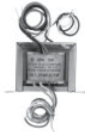
TR-710 70 Volt, 10 Watt