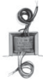
TR-255 25 volt, 5 watt